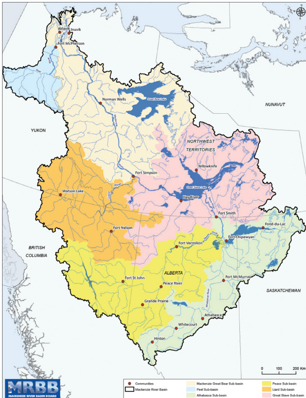
Figure 1. The Mackenzie River Basin

The following figure shows the Mackenzie River Basin.