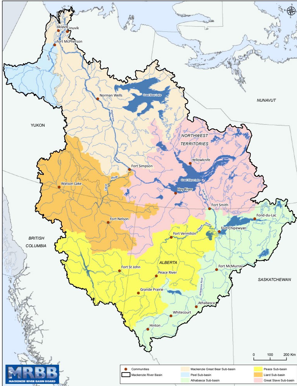
Figure 1. The Mackenzie River Basin.

This report summarizes the activities of the Mackenzie River Basin Board (MRBB), its Secretariat and committees for the Fiscal Year April 1, 2014 to March 31, 2015.